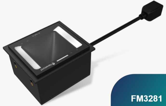
FM3281 Grouper Stationary Scanners