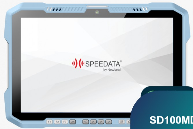
SD100MD Orion Plus Speedata