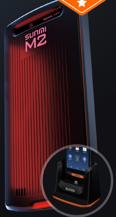
Optional single stand charger